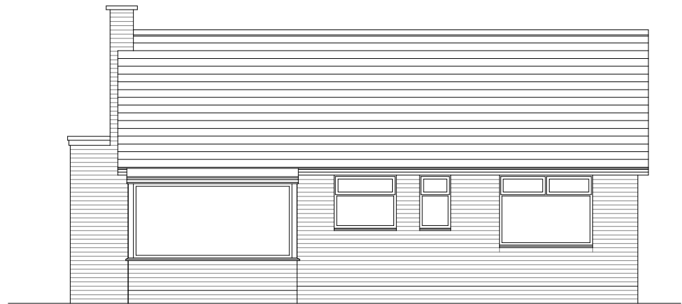
Existing North Elevation (scale 1:100@A3)