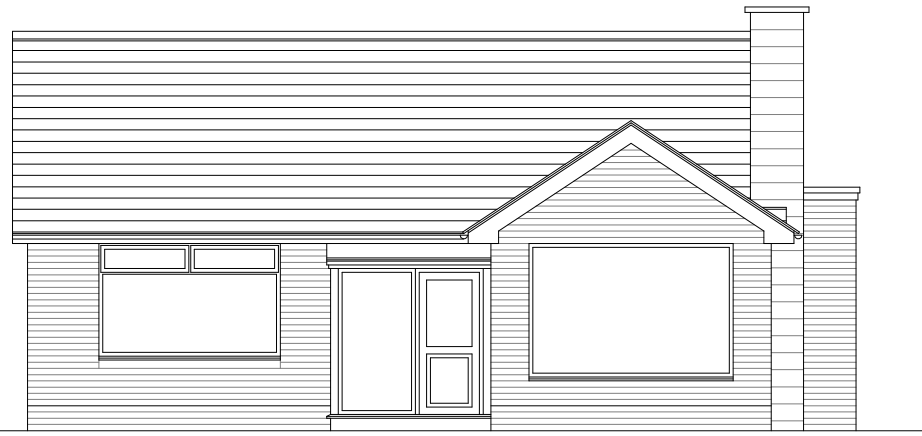
Existing South Elevation (scale 1:100@A3)